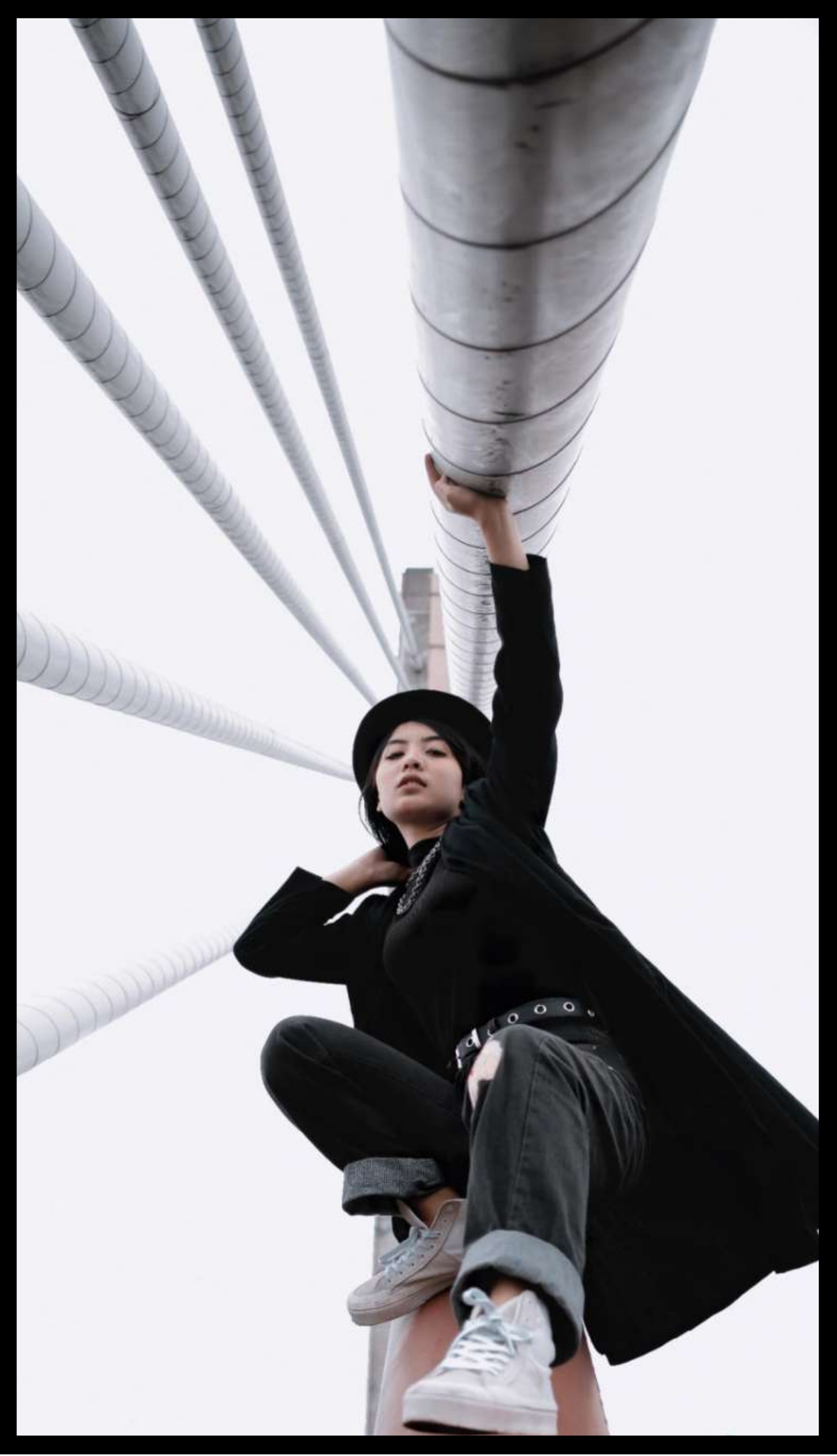
13" / 32" / 46" / 55"